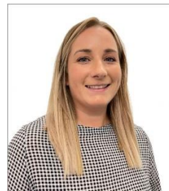
Flinders House Miss Lake