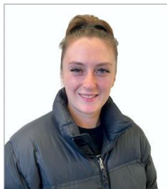
Bass House Miss Earth