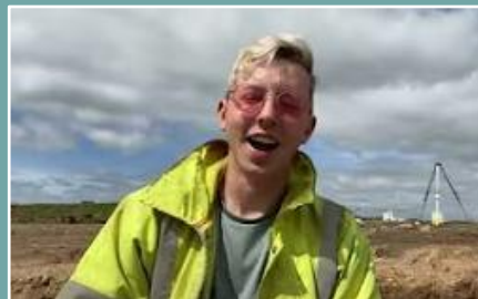
What do you get out of an archaeology degree?