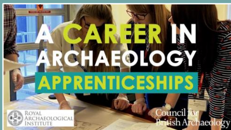
A Career in Archaeology - Apprenticeships