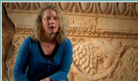
Day in the life of an Archaeologist