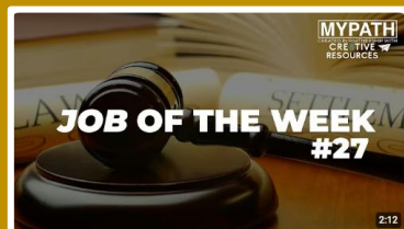
JOB OF THE WEEK - EPISODE #027 - BARRISTER