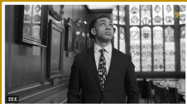
Why become a barrister?