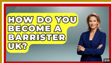
How Do You Become A Barrister UK? - United Kingdom Explorers.