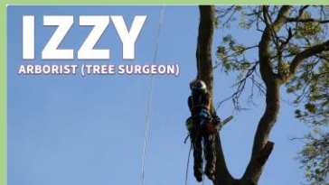
Meet Izzy the Arborist (Tree Surgeon)