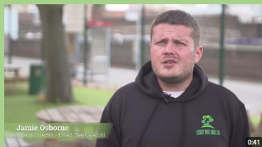
What qualifications are needed to climb and work on a tree? - Tree Surgery