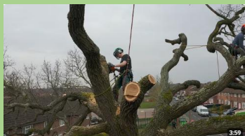
How to fell an English Oak Tree - With Essex Tree Care