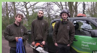
Careers on Hampstead Heath: Apprentice Arborist